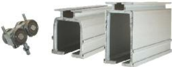
#55 TRACK & TROLLEY