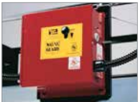
WayneGuard™ Fire Door Release Device