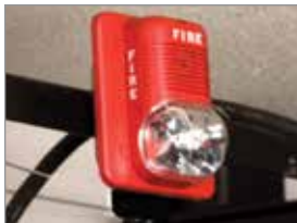
Horns and Strobes